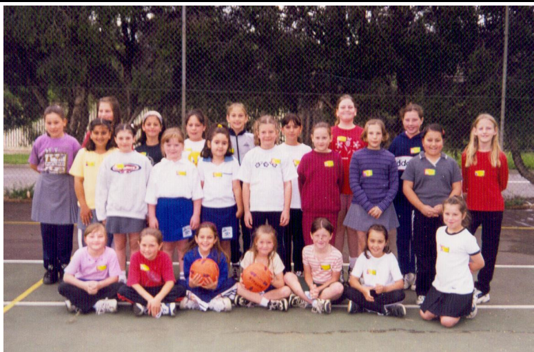
Netta 1999 - Do you recognise any of these netballers/umpires?